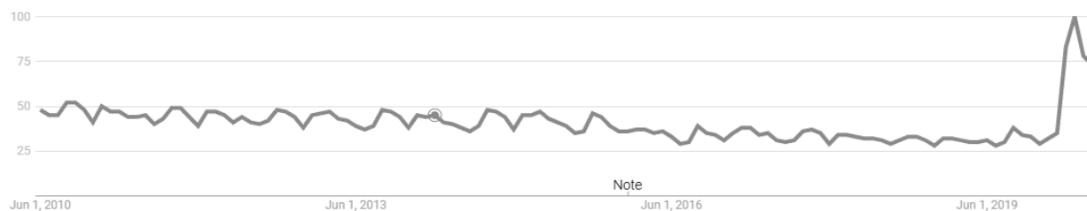
Figure 2. Online Learning - Patterns of Search Interest (Author's Data)

The abovementioned dynamics provide the evidence that the popularity of online learning requires specific urgent solutions in the current circumstances. Scholars underline the role of ICT in enhancing the sustainability of learning for citizens of all ages and providing new career opportunities for researchers (Anikeeva et al., 2019; Soltovets et al., 2020; Strielkowski & Chigisheva, 2018; Tarman & Dev, 2018). Coldwell et al. (2008) recommend that the faculty should make sure that the digital content they offer can be utilized by all students regardless of their cultural background. It has been established that some aspects of international students' adaptability largely depend on their individual adaptability (Hua, 2017) which is positively related to cross-cultural adjustment (Etherington, 2019; Liu, 2017). Therefore, the process of transition to online learning should be focused on mitigating the risks of maladaptation and avoiding the disruption of the learning process during such transition.