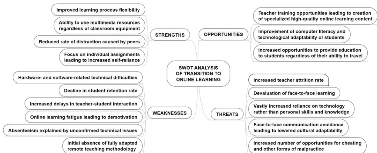
Figure 3. SWOT Analysis of Transition to Online Learning (Author's Data)

The research findings demonstrate the impact of various methodological, technological and psychological issues caused by the emergency transition to online learning on the adaptability of international students and offer an insight into the perceived advantages and disadvantages of the system as well as its opportunities and threats both in the short-term and the long-term perspectives. In order to categorize these variables and present their overview, the principles of strengths, weaknesses, threats and opportunities (further SWOT) analysis were implemented to build the SWOT mind map diagram, see Figure 3: